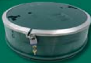
Lid-Lok Safety Device (20") 3009-LOK (24") 3008-LOK