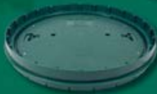
24" Dual Safety Cover 3009-KYDC