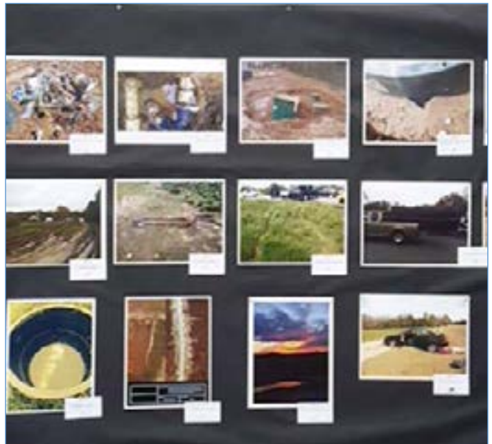
Examples of the best and the worst in an SSTS world!