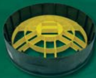
Safety Screens (12") 3017-SS (20") 3009-SS (24") 3008-SS