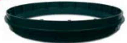
24" x 2" Riser 3008-GR2