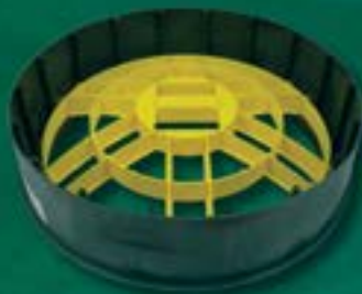
Safety Screens (12") 3017-SS (20") 3009-SS (24") 3008-SS