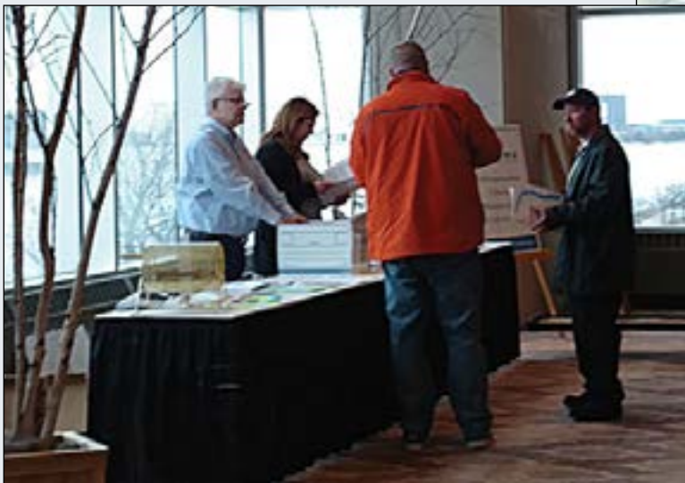
From early morning registration (shown left) to end of the evening prizes and auction items (shown Pg. 7, lower left), the MOWA Conference gave everyone something to take home and use!