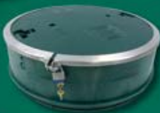
Lid-Lok Safety Device (20") 3009-LOK (24") 3008-LOK