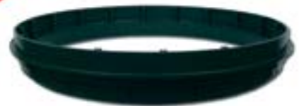
24" x 2" Riser 3008-GR2