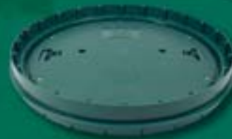
24" Dual Safety Cover 3009-KYDC